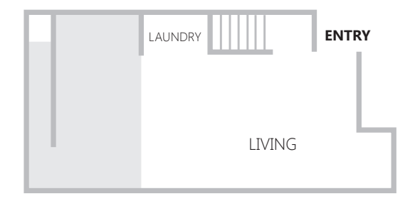
* Sample floor plan