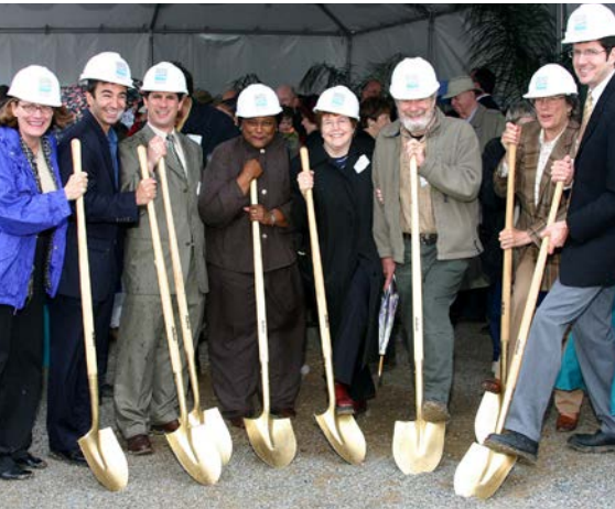
Corte Madera, CA