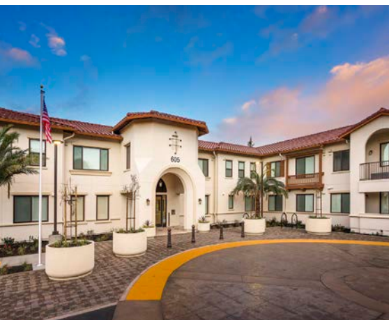
Menlo Park, CA