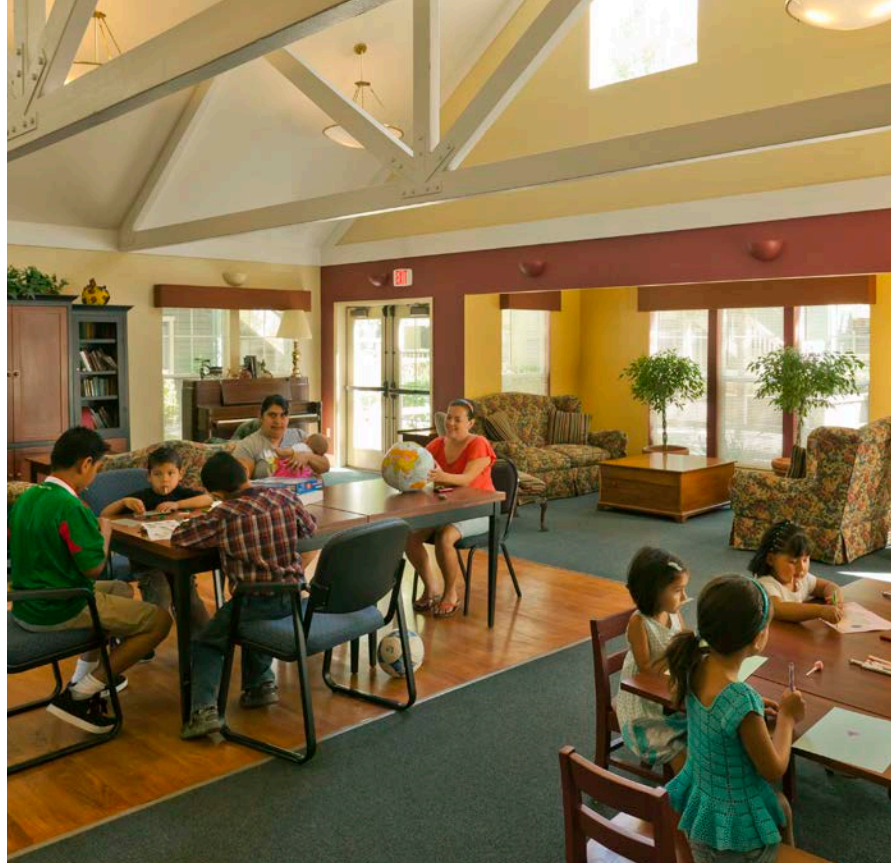
St. Helena, CA

“ Throughout our history, stewardship has been at the foundation of our work — guaranteeing quality housing that stays affordable and is built to last for generations to come”.