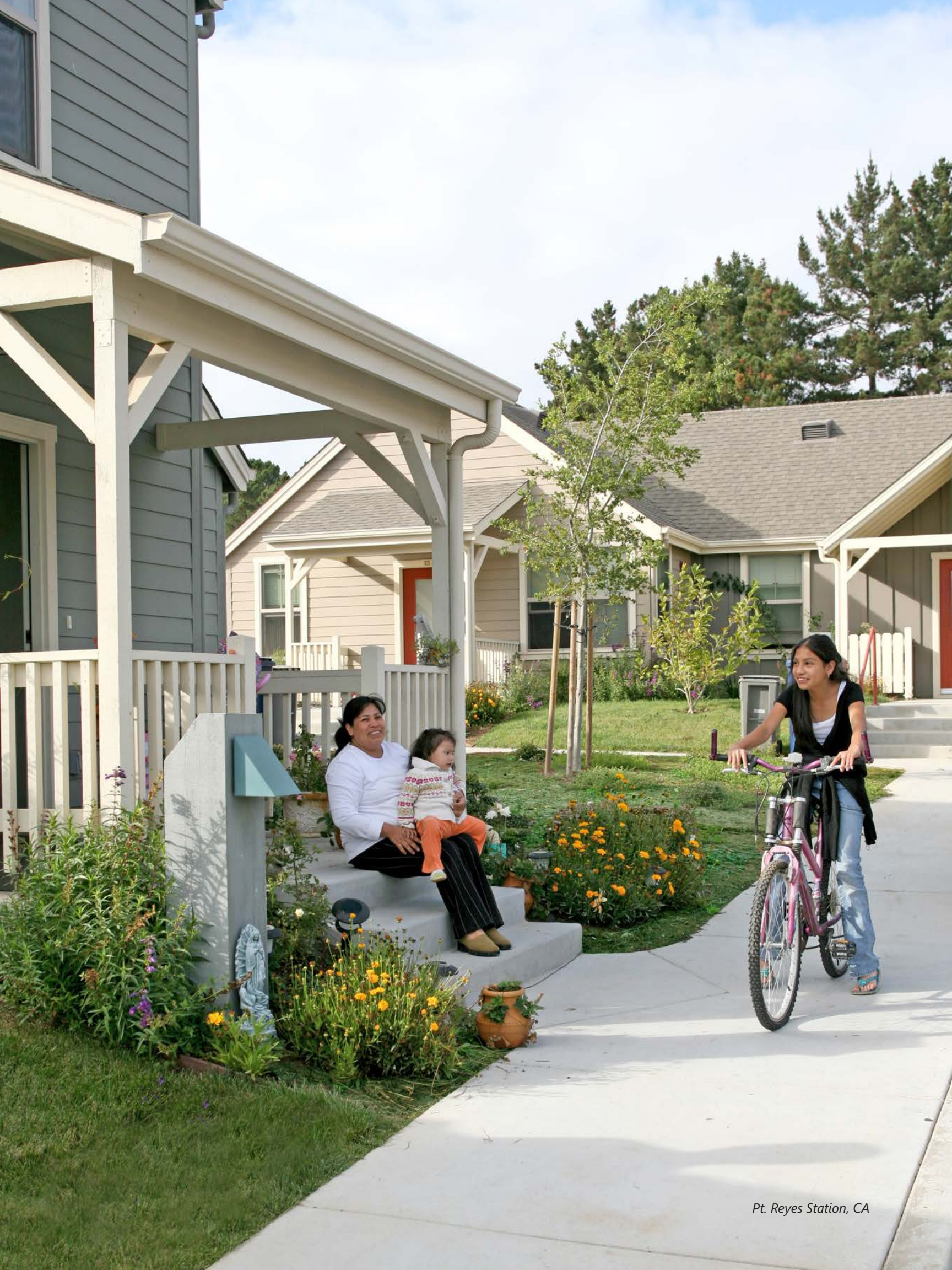
Pt. Reyes Station, CA