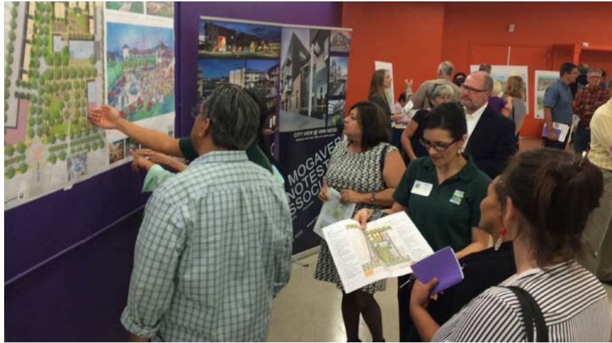
Santa Rosa, CA