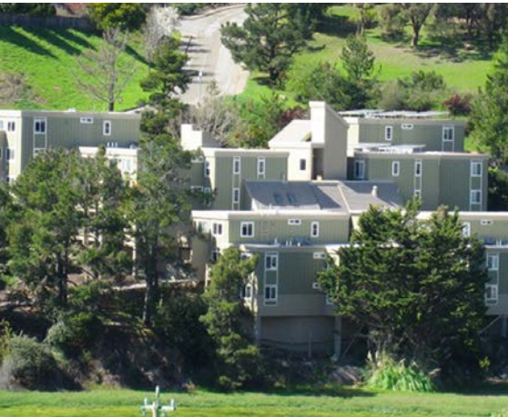
Mill Valley, CA

EAH Housing is a regional leader in renovating properties for permanent affordability in response to the growing national loss of affordable housing.