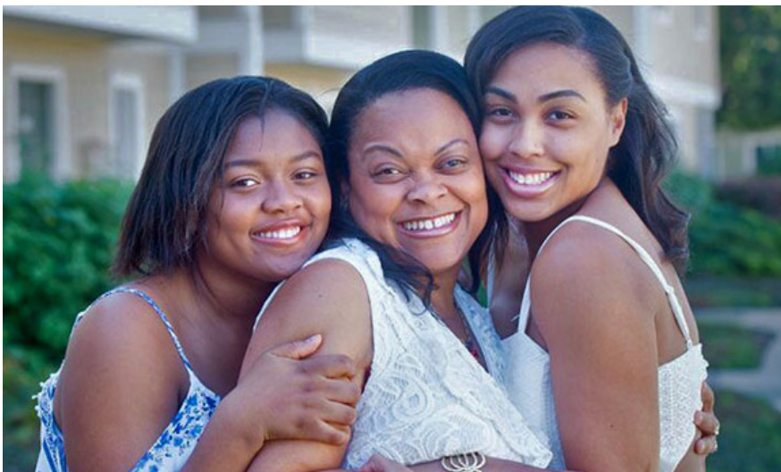
Union City, CA