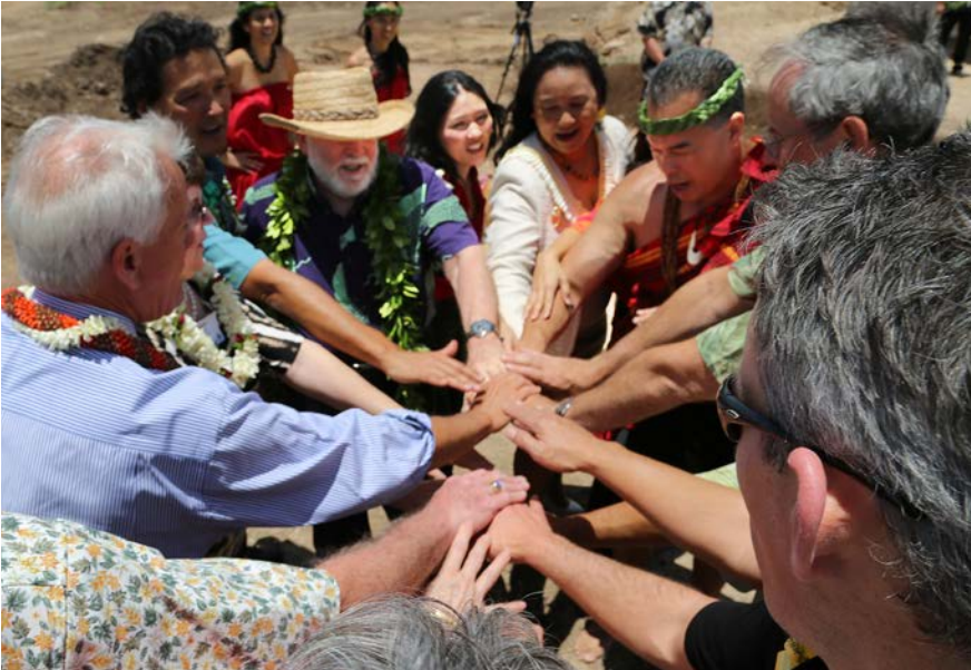
Ewa Beach, HI

EAH Housing was founded with the belief that quality affordable housing is the cornerstone to sustainable, healthy communities. We are celebrating more than 50 years of dedicated service on behalf of the 25,000+ residents that live at our properties throughout California and Hawai'i.